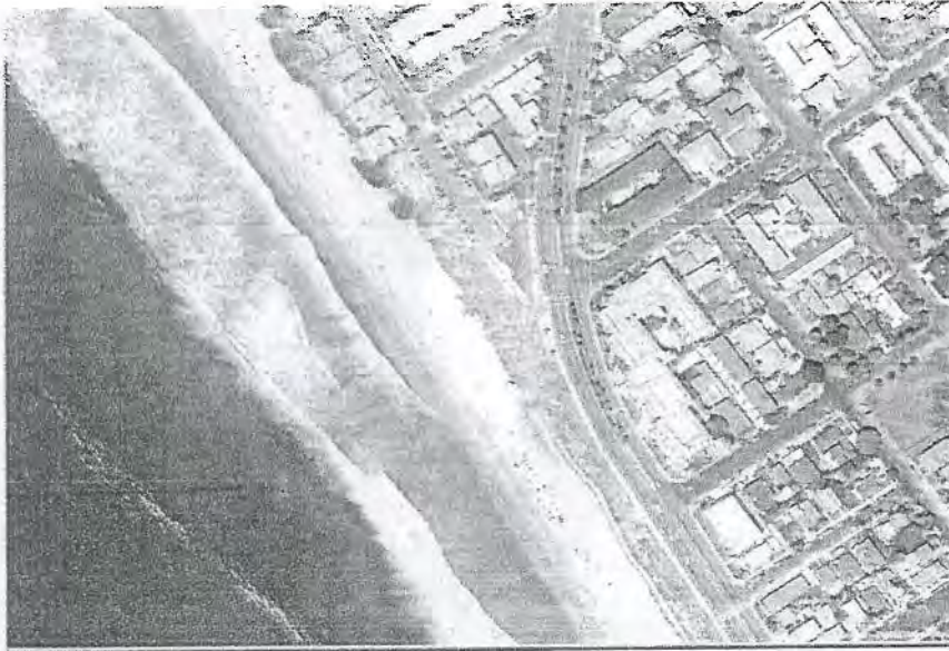
EXHIBIT A – PREMISES